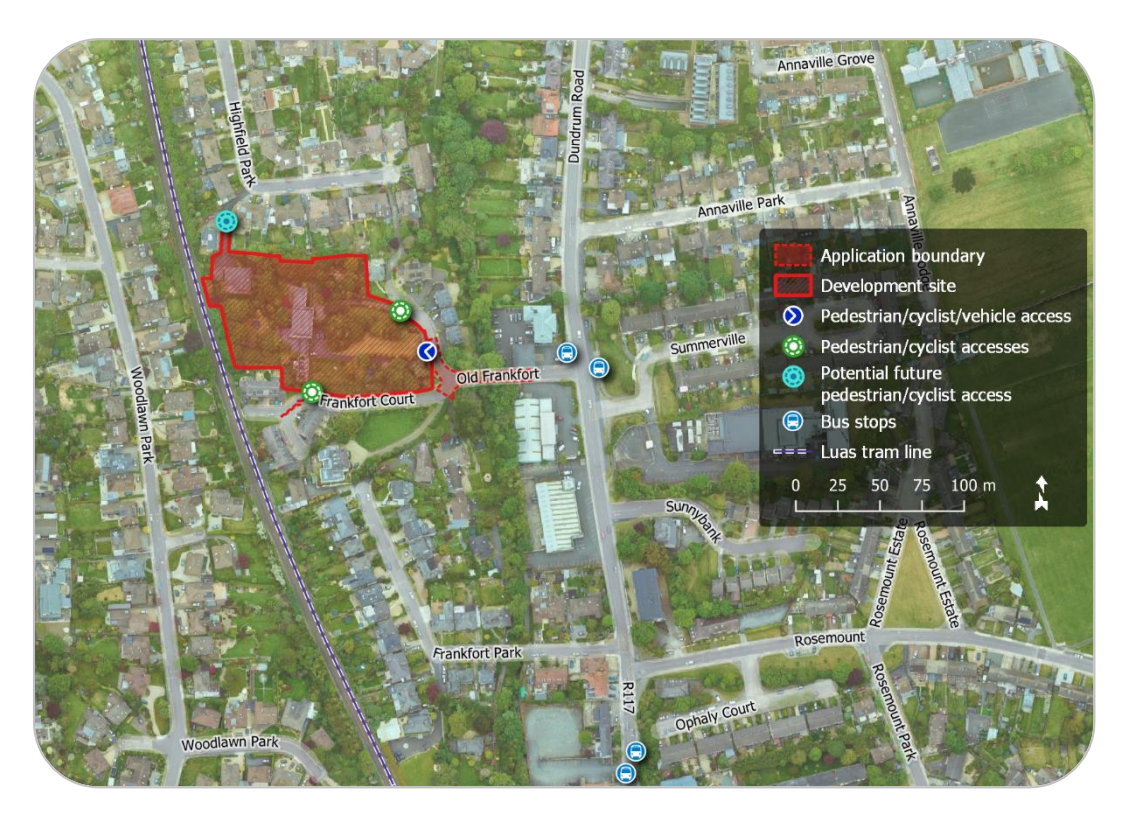
Figure 2 – Site extents and environs (map data: EPA, NTA, OSM Contributors)

frontage on Frankfort at its eastern boundary, and on Frankfort Court at its southern boundary.